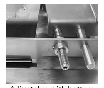
Adjustable with bottom gage for precision cuts